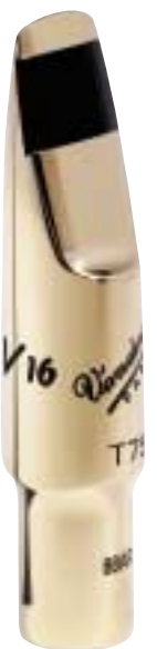
The metal tenor mouthpiece V16, forged in the legendary "Bell Metal" alloy, gold-plated.