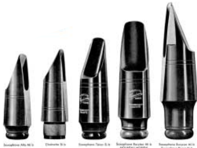
Saxophone Alto M4 B Clarinete B4 Saxophone Tenor B4 B Saxophone Bariton M4 B Saxophone Bariton M4 B Saxophone Bass B4 B