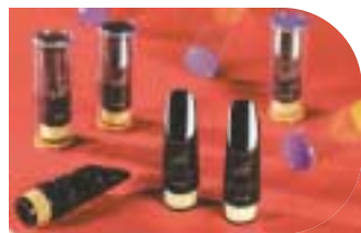
Extracts from the 1970 general catalogue.