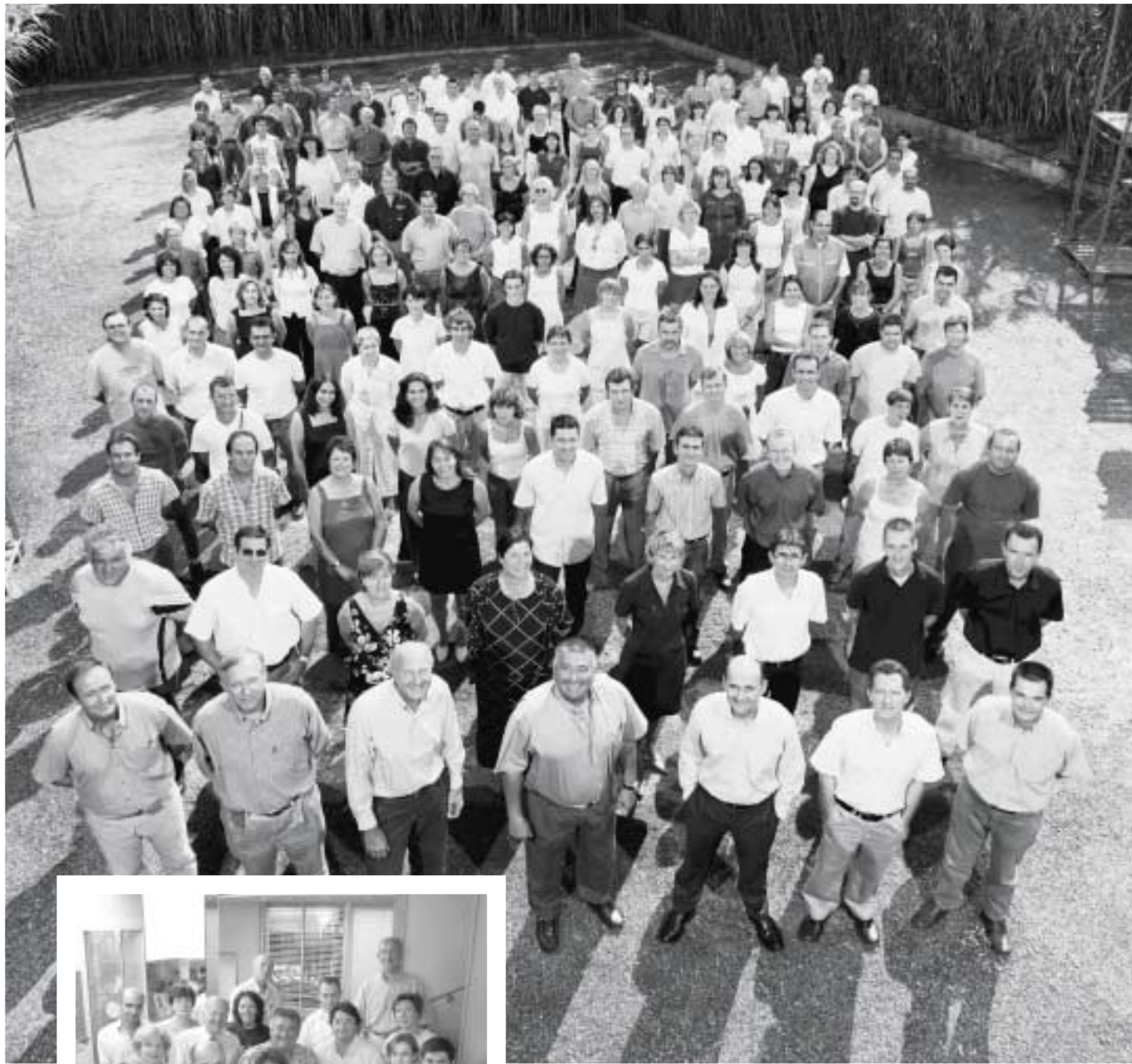
The Vandoren team in Bormes