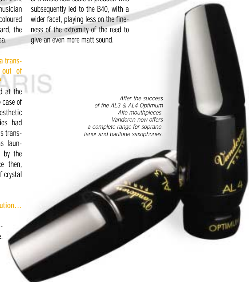
After the success of the AL3 & AL4 Optimum Alto mouthpieces, Vandoren now offers a complete range for soprano, tenor and baritone saxophones.