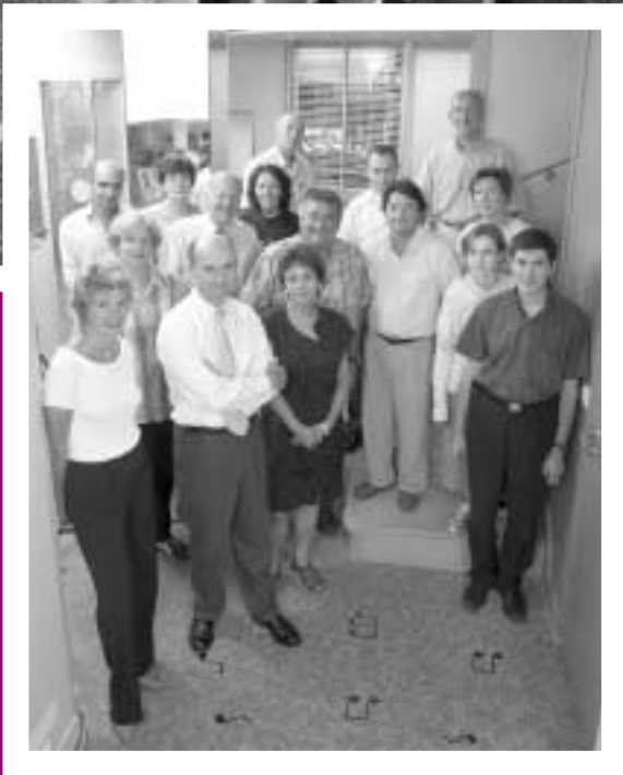
The Vandoren team in Paris